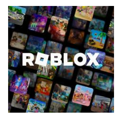
Roblox – New Parental Controls and Safety Features

The focus of this term has been Online Safety. Staff have attended training to ensure they continue to safeguard students appropriately and are aware of the continuing challenges children face.